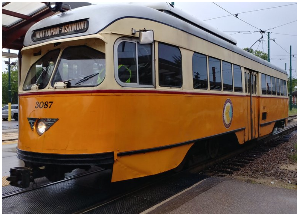
Figure 1. PCC car on the Mattapan Line (Yelp, 2018). 1

The line has about 6,600 average daily weekday boardings (3,200 inbound and 3,400 outbound). 2 It services three neighborhoods: Mattapan, Milton, and Dorchester. Mattapan and