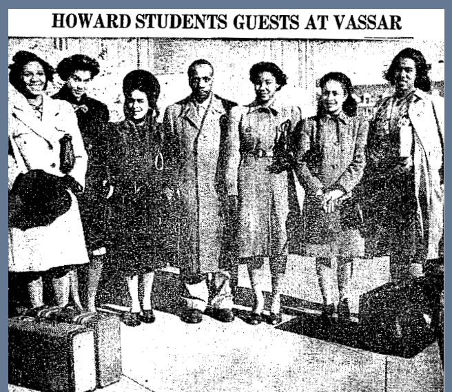
The Chicago Defender writes about Howard Thurman returning to Vassar as a guest chapel speaker in 1941. He brought with him students from Howard University.